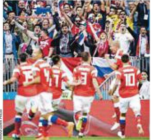
TEAM SPIRIT: Russia won its opener against Saudi Arabia, 5-0, as soccer's World Cup got under way in Moscow. For coverage of the tournament, see A12 and WSJ.com/WorldCup.